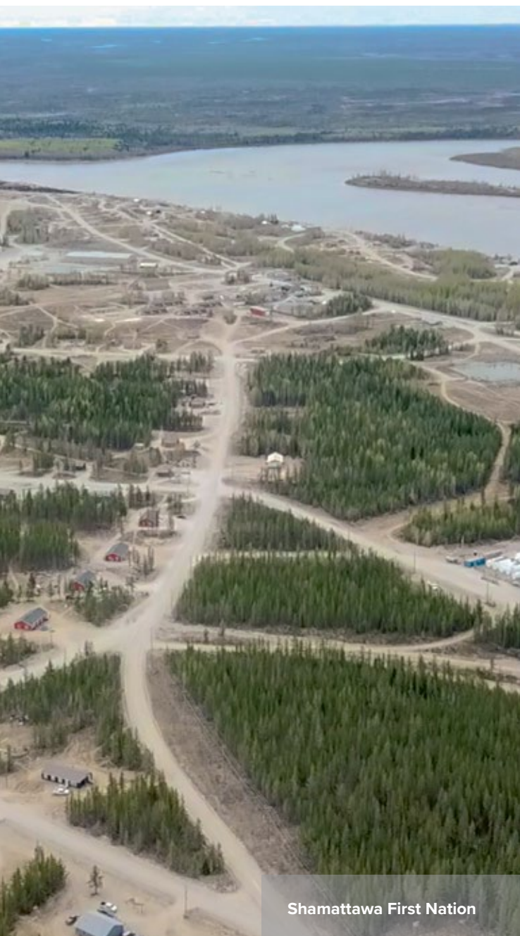
Shamattawa First Nation